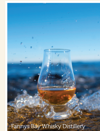
Fannys Bay Whisky Distillery

a: 1337 Pipers Brook Rd, Pipers Brook p: 03 6382 7229 w: dalrymplevineyards.com.au Self guided vineyard. Tours available Mon–Fri Wine tasting by appointment